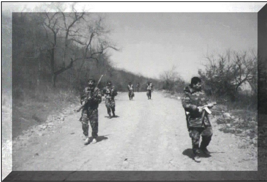
A reconnaissance patrol

The Azadakragan Panag results from the necessity to constitute an army, which appeared at a time when the situation in Artsakh demanded the transformation of the villagers self-defence groups into a structured force organized according to military rules, with a view to the defence against any external aggressions.